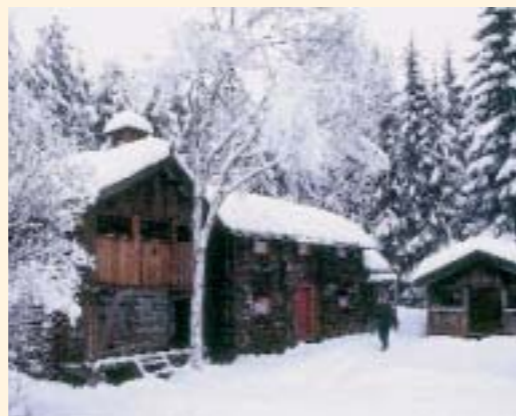
Traditional log houses renovated by Sigmund Aarseth.

In urban areas wooden houses had their distinct disadvantages—virtually all Norwegian cities and towns, originally made up of wooden houses, have at some point in their history been ravaged by devastating fires and rebuilt in brick or stone.