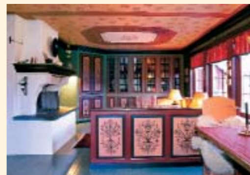
This richly decorated farmhouse living room is a good example of a modern 'traditional' interior. A traditional color scheme has been used, and all of the woodwork has been painted, including the floor.

In current times, decorative elements were reduced and stripped down to the basics and 'Scandinavian design' soon established itself as a trademark for functional but stylish products around the world. This deliberate break with the old stylistic elements has had a significant impact on Norwegian arts and crafts traditions. Many of the artistic skills that had taken hundreds of years to develop and refine were lost in the span of one generation.