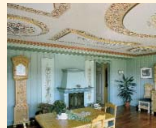
This interior represents a mixture of seemingly conflicting influences, but with an interesting and individualistic end result. The fireplace, grandfather clock and cupboard are traditional ingredients in a Norwegian interior. The color combinations on the other hand are contemporary and fresh, so the overall ambience is quite urban and modern.