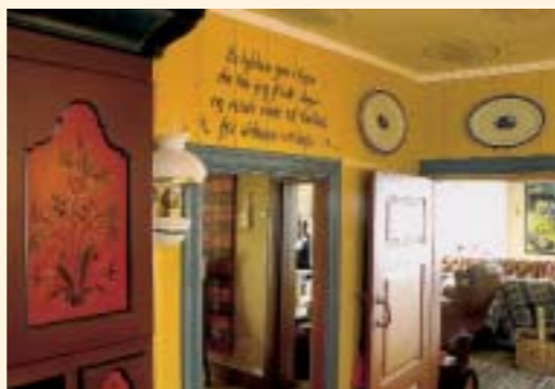
This colorful interior includes several decorative elements inspired by nature. The cabinet features a Rosemaling design with clear flower inspirations, and stylized clouds on the ceiling.

The increasing dominance of modernism in Scandinavian architecture and design of the twentieth century must be seen in relation to the prevailing global trends as well as the economic and cultural situation during this time. Norway re-established