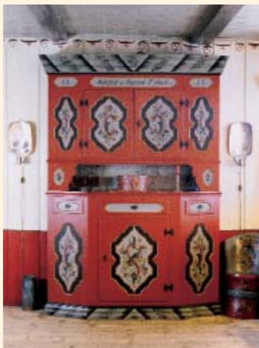
A 'framskåp' with traditional Rosemaling decor.

The Rosemaling tradition started in rural Norway, rather than in the cities, and was explored to its fullest in individual homes. Each district developed its own characteristic style, and there were enormous regional as well as individual variations. Some of the most prolific practitioners of Rosemaling were to be found in the remote highland valleys of Norway.